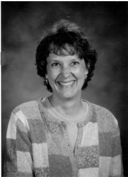
Curiosity blooms in this writer's garden. Even after twenty-four years in the classroom, this "wondering" woman is always looking for a creative or colorful approach to elicit ideas from writers.

In my mind's eye, buoyant butterflies and buzzing bees and green grasshoppers