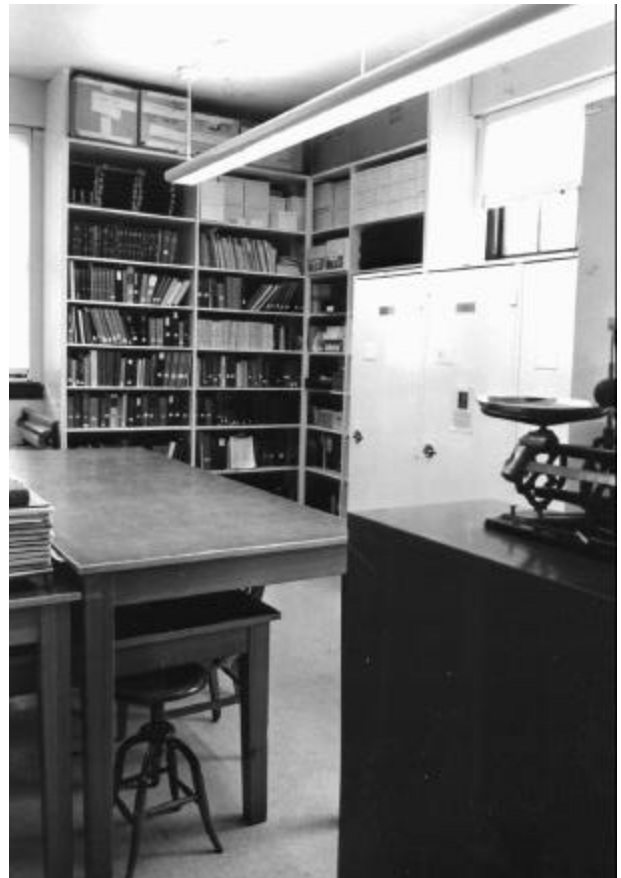
The Herbarium preparation room after renovation